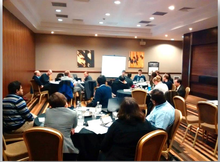
Participants during brainstorming session