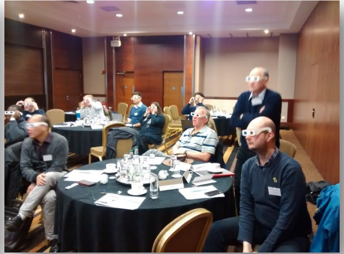
During stereo vision demo